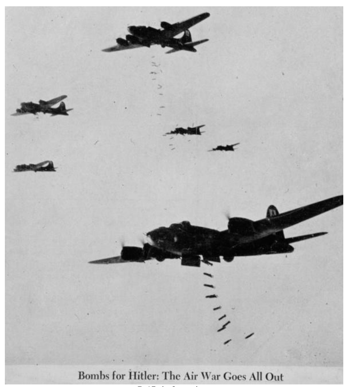
B-17s in formation.